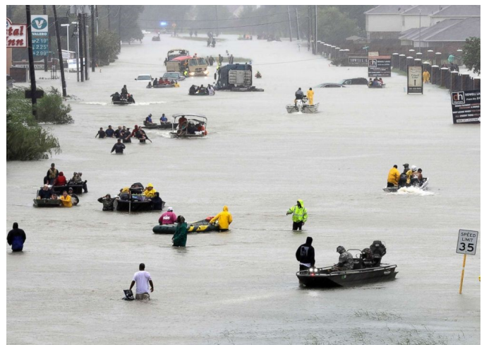
Survivors walk through flooded waters in Houston as Hurricane Harvey batters southeast Texas.

We hear the term "united we stand" so often it almost sounds cliché, but the people of Houston remind us just how powerful that concept can be, even in the face of a menacing threat. It's a concept that makes our military great, our union strong, and our country the most amazing experiment in governance that the world has ever known. And with another monster hurricane now bearing down on Florida and the gulf states, it's a concept that we must turn to again for the sake of our fellow Americans.