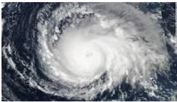
Hurricane Irma might be even worse than Harvey.