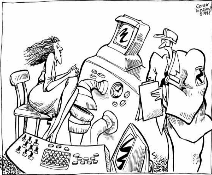
"You'll need a bathroom pass signed by the plant manager... unfortunately, he took the afternoon off."