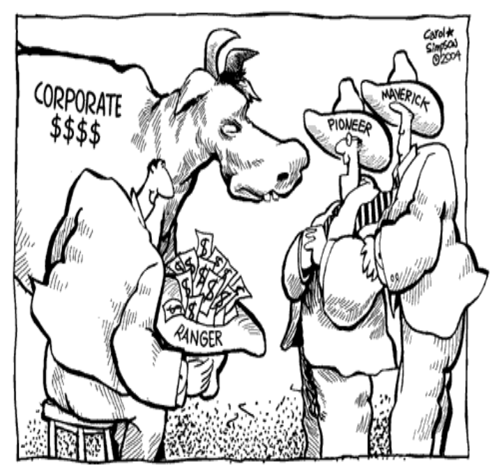
The Bush Campaign Cowboys Get A Milking Lesson

If we have another disaster like the Powerhouse compressor malfunction will Facilities have the tools to bring us back online in a timely manner? Why is the company courting disaster by failing to maintain equipment? All that's needed are the right parts and the right tools to do our work properly. That's not too much to ask for...is it?