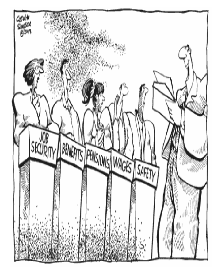
"...and the winner of this week's "Race to the Bottom" is..."